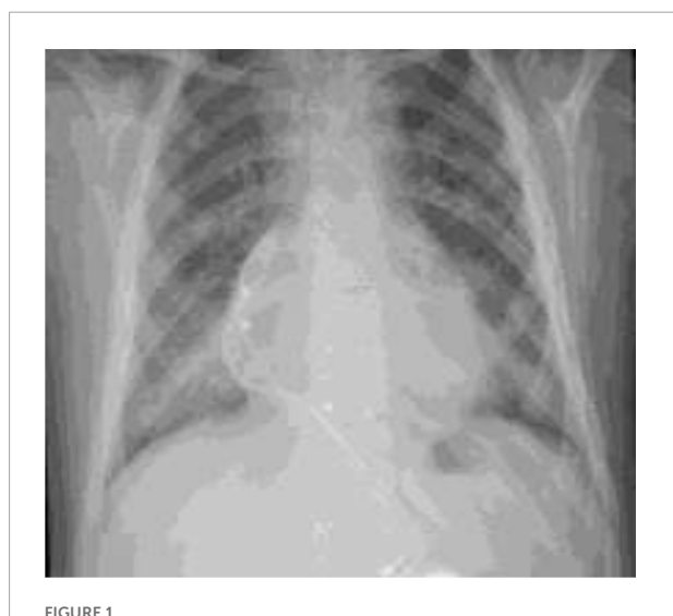
Chest x-ray of the second patient.

A 1-year- and 2-month-old male toddler developed cough, grunting, fever, and few episodes of vomiting (blood streaked) for 2 days. His mother had tested positive for COVID-19 PCR a few days earlier with mild symptoms. He was under follow-up at a congenital cardiac illnesses' clinic for patent ductus arteriosus and pulmonary hypertension and received daily oral furosemide and spironolactone. Upon admission, he was tachypneic at 50 breaths per minute with a saturation of oxygen in room air of