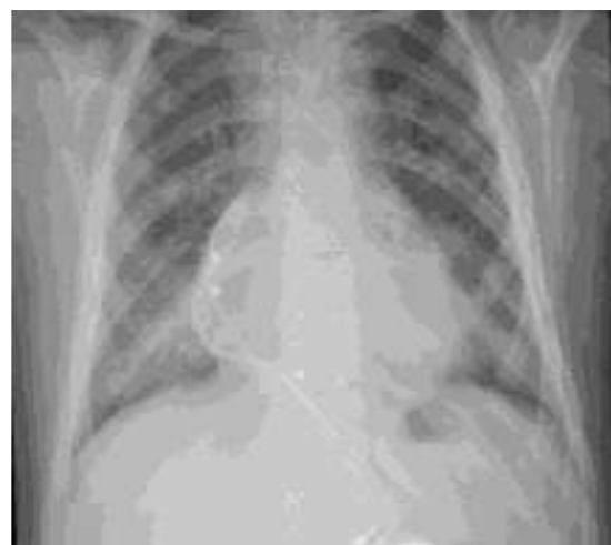
FIGURE 1 Chest x-ray of the second patient.

A 1-year- and 2-month-old male toddler developed cough, grunting, fever, and few episodes of vomiting (blood streaked) for 2 days. His mother had tested positive for COVID-19 PCR a few days earlier with mild symptoms. He was under follow-up at a congenital cardiac illnesses' clinic for patent ductus arteriosus and pulmonary hypertension and received daily oral furosemide and spironolactone. Upon admission, he was tachypneic at 50 breaths per minute with a saturation of oxygen in room air of