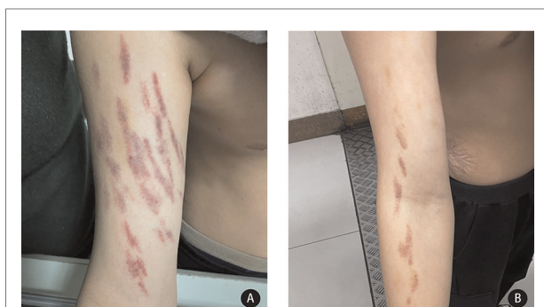
FIGURE 1 Striking linear symmetric purpuric streaks on the proximal extensor sides of both arms. The purpura was not palpable. (A) Purpura formed suddenly, (B) purpura 2 days after episode.

A 13-year-old boy was admitted to the West China Second University Hospital with the chief complaint of recurrent painful skin lesions on both upper limbs, which had lasted more than 2 years before his referral (since he was 11 years old). The boy had recurrent painful purpura on both arms, but there seemed to be no relationship between the pain site and the ecchymosis site. The purpura often flared up suddenly at night or after going to the bathroom, where he was alone. A physical examination revealed remarkable linear, symmetric (meteor shower-like) purpura on both arms (Figure 1). He had once been diagnosed with an allergic rash, or Schönlein purpura, and given glucocorticoid and other anti-allergic treatment. Although the ecchymosis subsided, this type of skin lesion was easy to relapse. In the latest episode, ecchymosis on both upper limbs reappeared, with the same morphology and distribution, and with pain all over the