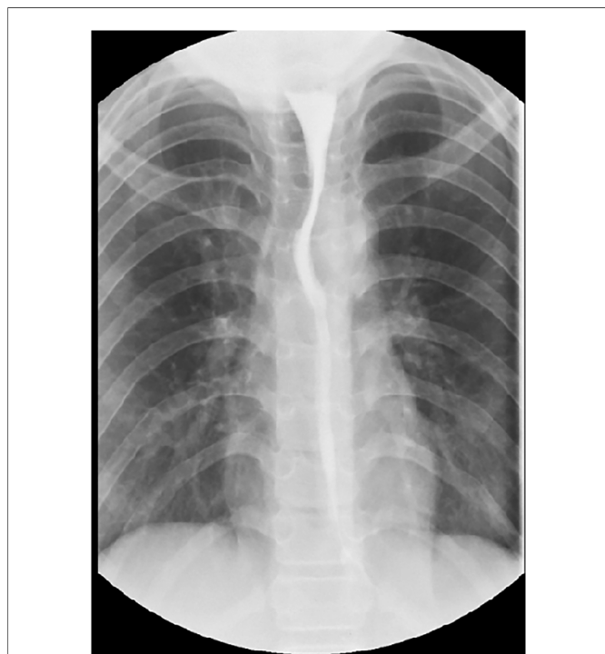
FIGURE 1 Upper gastrointestinal radiography showed diffusing contraction of the lower esophagus.

Six months after the procedure, the patient's Eckardt symptom score had decreased to 2 points, he could ingest semi-solid food, and his height and weight increased by 1.5 cm and 2 kg, respectively. Notably, his neurological problems partially persisted.