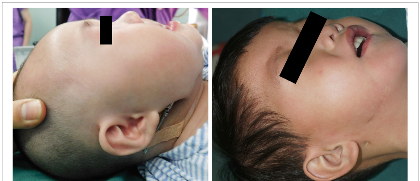
FIGURE 3 | The 3 months and 1 year post-operatively.

Our patients were 428 neonates with PRS who were in need of preoperative intubation and ventilator support to maintain ventilation. The age of the patients ranged from 3 days to 28 days (mean 13.12 days, median 6.5 days). When initially evaluated, 6 neonates suffered with severe growth retardation and required nasogastric feeding until they weighed 2.5 kg. All procedures were completed in <1 h, with <20 ml blood