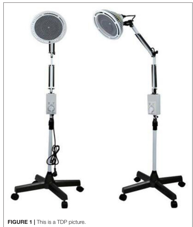
FIGURE 1 | This is a TDP picture.

Electromagnetic waves were generated by three TDP devices (Guoren, Chongqing Guoren Medical Equipment Co., Ltd., Chongqing) as detailed in Figure 1 . TDP treatment was initiated immediately after a confirmed diagnosis of NEC II and was