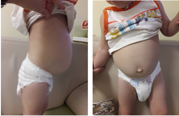
FIGURE 2 Hirschsprung's disease: abdomen distension.

hand. The girl could not run, jump, and walk upstairs. Her understanding of the addressed speech was full. She used pincer grasp, held the pen, but could not copy shapes (circle, square, etc.) or imitate vertical line. Denver Developmental Screening test at age of 4 years showed MQ = 0.62 ( N \geq 0.75 ) and DQ = 0.57 ( N \geq 0.7 ). Her cranial innervation was intact. She had muscle hypotonia, with muscle strength of 5 points in limbs according to the MRC scale (Medical Research Council scale for power of muscle), valgus flat foot. Tendon reflexes were normal. There were no meningeal and cerebral symptoms.