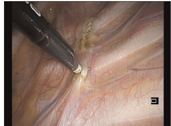
FIGURE 1 Identification of the sympathetic nerve.

All our patients had excessive sweating of the palms and experienced excessive hyperhidrosis leading to considerable social embarrassment that interfered in a negative way with the daily activities. The most consistent problems were embarrassment on shaking hands, difficulties in writing and drawing and difficulties relating with the opposite gender. All patients resulted unresponsive to medical treatment for at least 6 months. The contralateral procedure was performed 2 months after the first one. All patients had a severe type of primary hyperhidrosis of the hands. A preoperative x -ray of the chest was performed on all patients to rule out any kind of anomaly. After obtaining informed consent from the parents, the surgical procedure was performed with the patients under general anesthesia using single-lumen endotracheal intubation in the semi-sitting position, with the arms extended at 90 degrees. A 5 mm camera was then inserted using an atraumatic Versaport® trocar with a stab incision at the level of the middle axillary line in the fourth intercostal space. Under direct visualization, a second 5-mm trocar was inserted in the second intercostal space always at the level of the middle axillary line. A pressure of 5 mm Hg was used in all the cases. The sympathetic chain was identified, and the posterior parietal pleura opened (Figure 1). Two clips were applied above and under the third rib, if possible under the parietal pleura (Figure 2). The Kunz fibers,