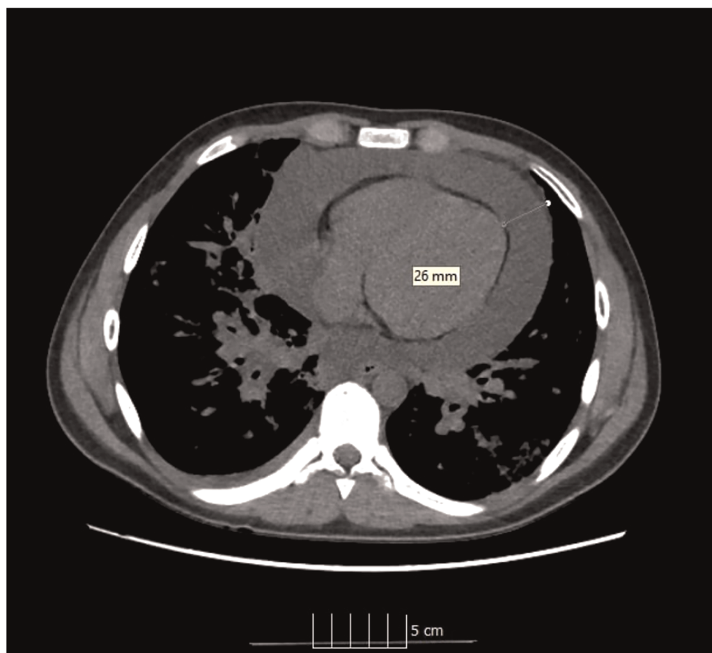
FIGURE 1 Ct image of pericardial tamponade.

Physical examination revealed high temperature (39.1 °C), tachycardia (125 bpm) and dyspnea requiring immediate oxygen therapy (peripheral oxygen saturation on room air was 85%). Mild hypotension (Hgmm 90/55 mmHg) was detected. Radial artery was palpable but weak. The patient was hemodynamically stable at this stage of the disease. Covid-19 antigen test and reverse transcription-polymerase chain reaction (PCR) of nasopharyngeal swab were positive. Our patient has not been vaccinated against the virus. COVID-19 infection was also confirmed in the parents by a rapid test. A chest CT scan was performed in view of the severe respiratory symptoms and COVID-19 positivity. Multifocal, bilaterally thickened interlobular and intralobular lines in combination with a ground glass pattern was detected, the CT Covid-19 score was 16/25. A 26 mm wide circumferential pericardial effusion was identified around the ventricles (Figures 1, 2). Electrocardiogram detected low QRS voltage, but ST-elevation or other electrical alteration was not observed. Characteristic echocardiographic abnormalities for