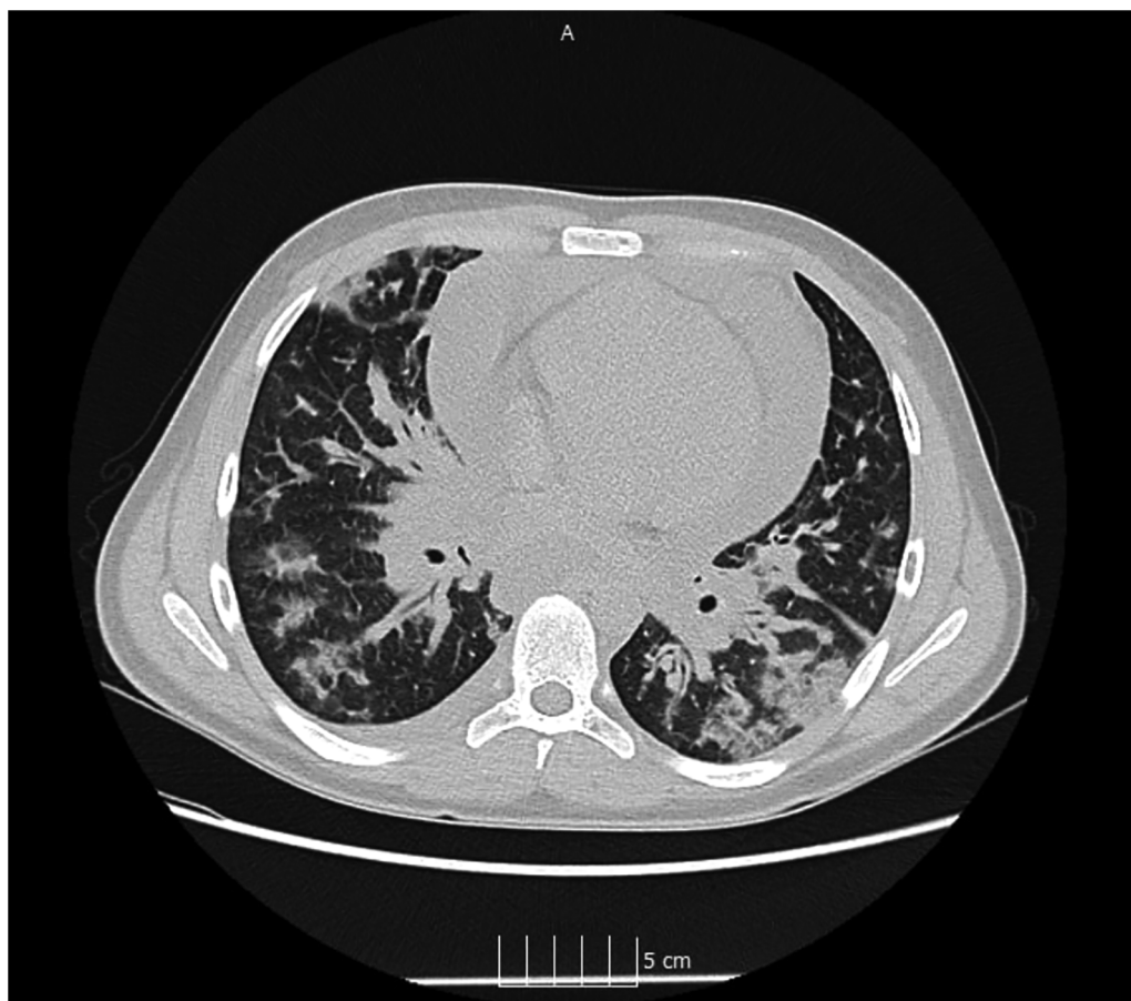
FIGURE 2 Ct image of COVID-19 pneumonia.

pericardial tamponade, such as right atrial diastolic collapse and paradoxical septal motion, were seen.