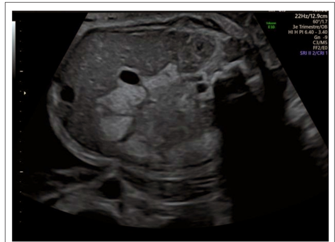
FIGURE 1 | Antenatal ultrasound at 30 weeks of gestation.

A thorough renal laboratory investigation shows proximal renal tubulopathy with proteinuria/CrU 825 mg/mmol ( N <