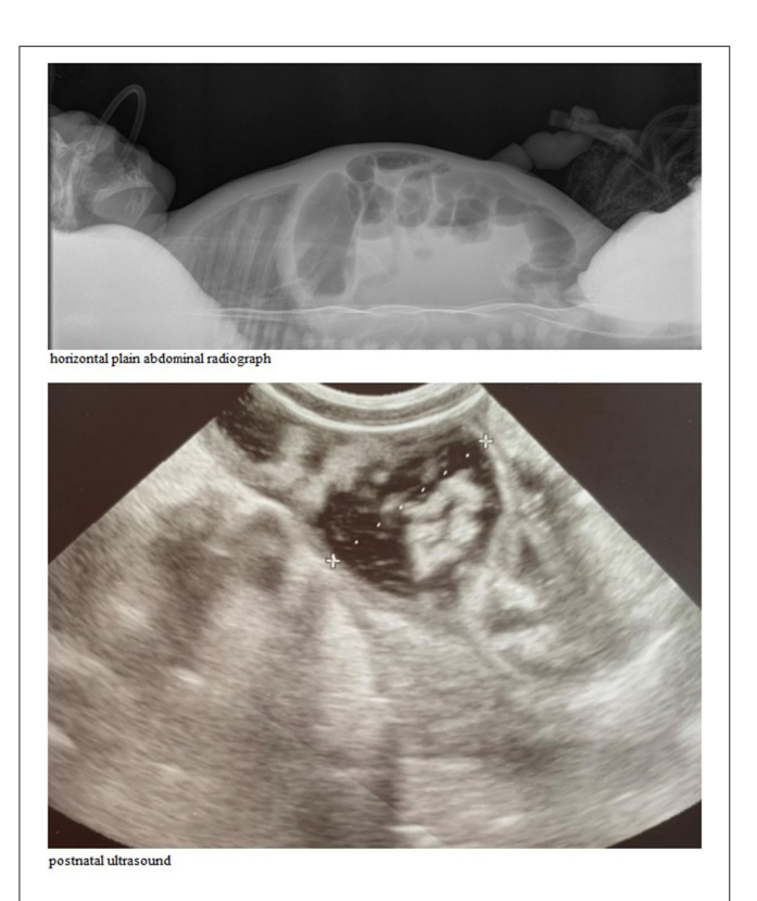
FIGURE 2 | Abdomen X-ray in the first day of life, horizontal radius (Top) . Abdominal ultrasound examination showing significantly distended intestinal loops of the newborn (Lower) .

After initial improvement, the patient's condition deteriorated once again and he suffered abdominal bloating, weight loss and irritability; positive fecal occult blood was also noted. The diagnosis of sepsis was made on the basis of blood cultures. Rehydration, total parenteral nutrition, omeprazol and antibiotics consistent with sensitivities were administered. After markers of infection decreased, oral re-feeding was initiated, with the mother's milk. Breast milk intolerance, however, was noted, despite the mother's adherence to a non-dairy diet. Introduction of a hypoallergenic amino acid formula