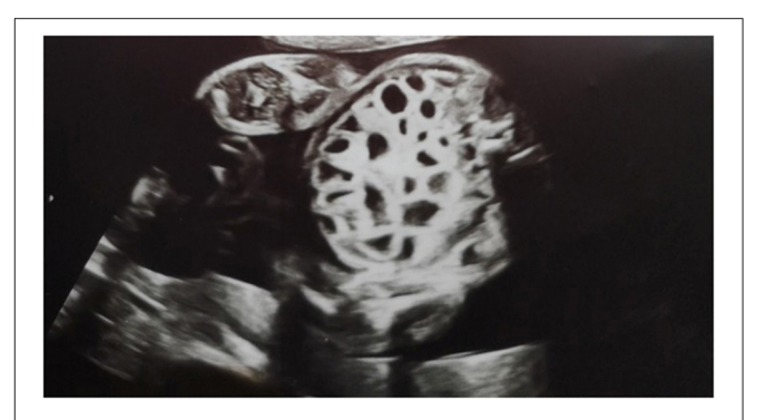
FIGURE 1 | Ultrasound views at 24 weeks and 4 days of gestation showing multiple dilatation of the bowel loops filled with fluid.

A second-pregnancy male neonate (the previous pregnancy ended in miscarriage) was delivered by emergency cesarean section at 32 and 4/7 weeks gestational age (GA) due to suspected fetal intrauterine bowel obstruction. Birth weight of the baby was 2260 g (50–90 percentile). In the 28th week of pregnancy, hospitalization of the mother was required due to detected