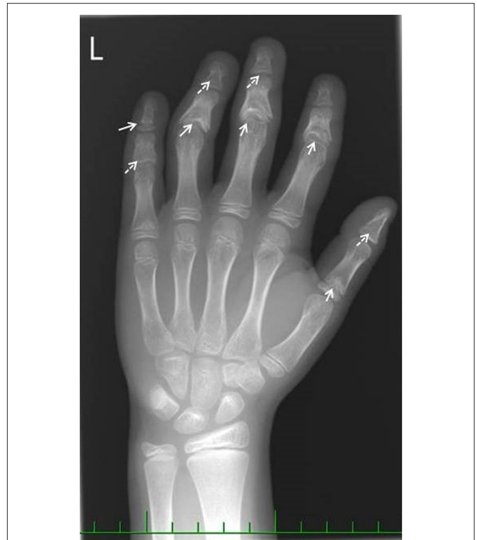
FIGURE 1 | Hand X-ray image. Full arrows show coned epiphyses. Dashed arrows show the premature closure growth plates due to coned epiphyses.

glomeruli. Electron microscopy revealed diffuse pedicular fusion. Conservative therapy of chronic kidney disease (darbepoetin, calcitriol, amlodipine) was introduced. Chronic peritoneal dialysis was started after two months due to significant deterioration of kidney function. Our patient underwent successful cadaveric kidney transplantation 9 months later. Her post-transplant course was uneventful until the last observation (at age 6 years). Due to the unknown etiology of the primary nephropathy in our child, further genetic testing was indicated.