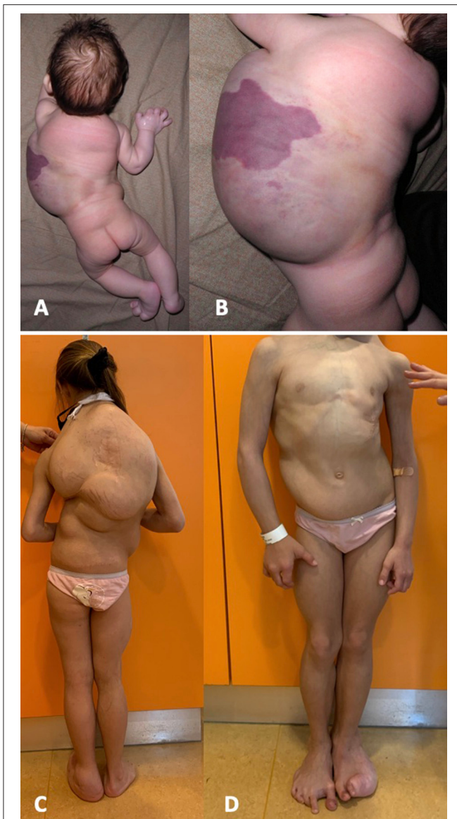
FIGURE 1 | Representative pictures of our patient at birth (A,B) and at the age of 8 years (C,D). She was born with a thoraco-abdominal large lymphangioma, covered by a capillary malformation, and hypertrophy of the left foot. She developed a severe dorsal scoliosis and a progressive overgrowth of the fibroadipose tissue, mainly localized at the trunk and at the left foot, with evident sandal gap at the right foot.

other hand, repurposing cancer therapies for treatment of vascular anomalies and segmental overgrowth syndrome has prompted scientists to revisit therapeutic approaches in cancer patients (12). Conventional therapeutic approaches, such as scleroembolization or surgical debulking procedures, are rarely curative in patients with vascular malformations and PROS disorders and are not devoid of risks of complications and recurrence. Since constitutive activation of the PI3K/AKT/mTOR pathway is a major cause of vascular anomalies and overgrowth syndromes, the use of mTOR inhibitors, such as Sirolimus, appeared as a good therapeutic strategy (4). Nevertheless,