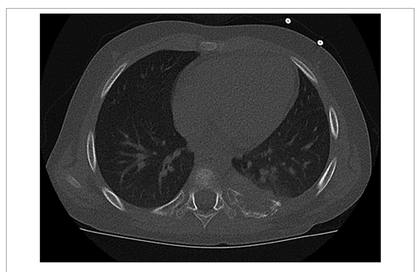
FIGURE 2 | Tumor arising from the paravertebral dorsal portion of the left 7th rib with infiltration of the transverse process and vertebral body. This extent required en bloc resection of the ribs 6–8 and additional removal of the costovertebral joint and hemilaminectomy (patient #10).