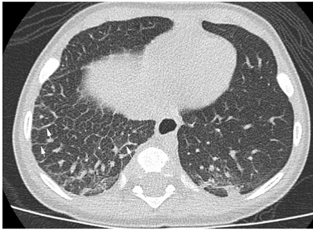
FIGURE 1 | High resolution chest CT showing diffuse thickening of the interlobular septae (white arrows) in the right lung.

fibrosis. Sweat testing on the patient was negative. Genetic testing did not identify bi-allelic disease-causing mutations and a chromosomal microarray was normal. He underwent flexible fiberoptic bronchoscopy which revealed bilateral small, edematous airways. The bronchoalveolar lavage fluid contained predominantly histiocytes with negative cultures and no lipid-laden macrophages with Oil Red O stain. Ciliary ultrastructure was normal under transmission electron microscopy. Further testing revealed normal immunoglobulins and vaccine titers and a normal video fluoroscopic swallow evaluation.