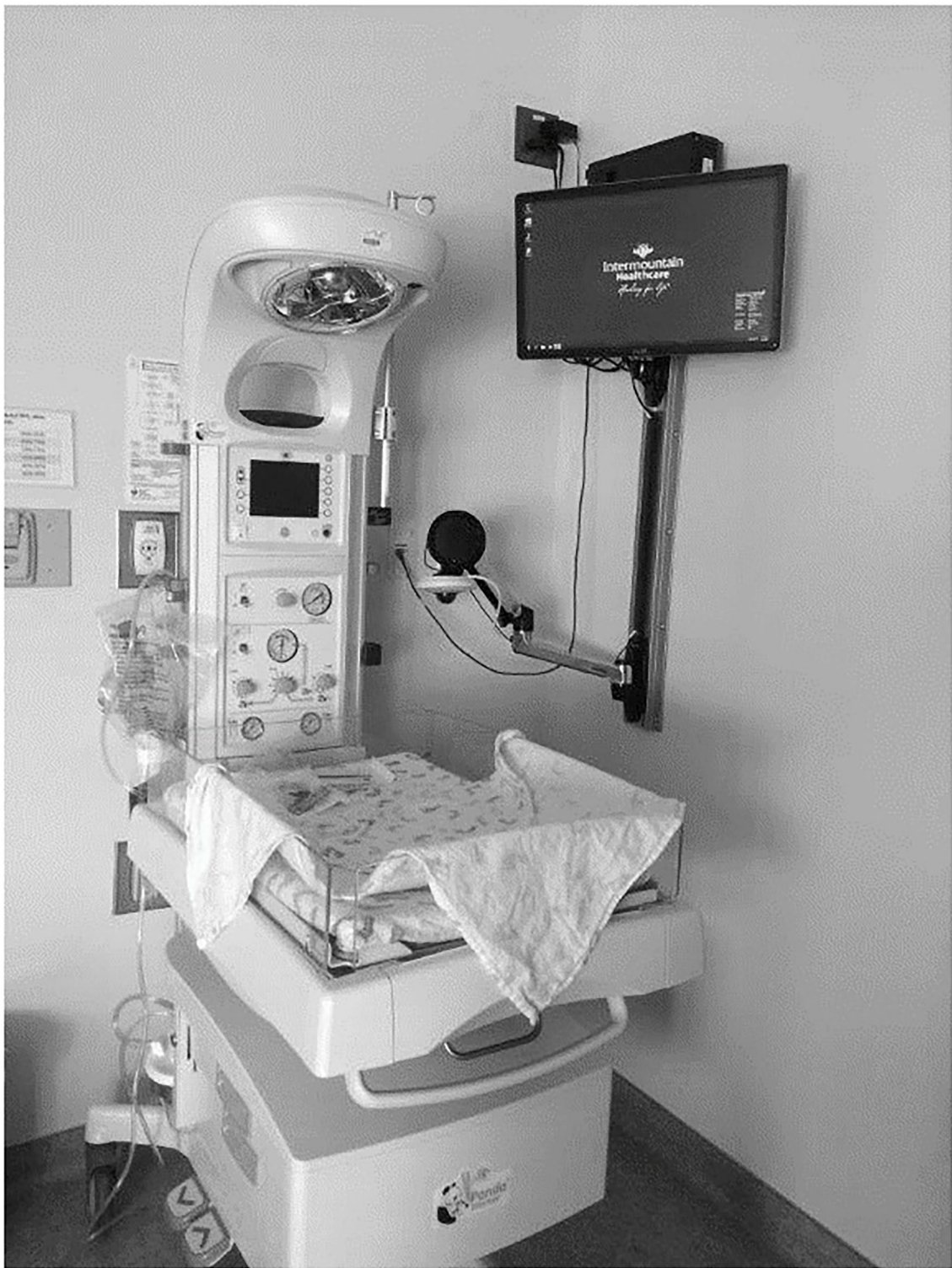
FIGURE 2 | Wall mounted newborn telehealth station at spoke site.