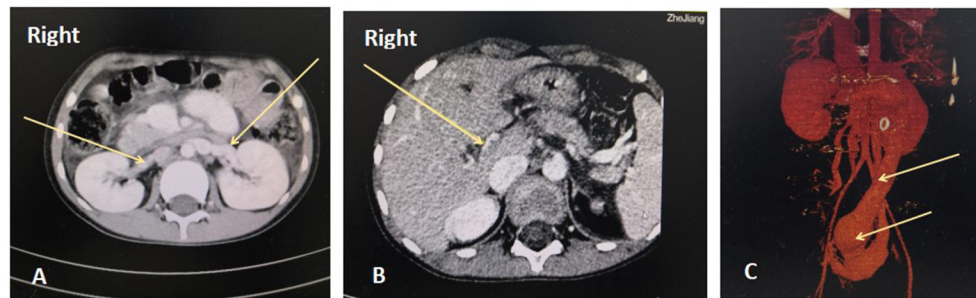
FIGURE 1 | Abdominal enhanced computed tomography angiography (CTA). A. Bilateral renal veins are enlarged and thickened. B. The right branch of the portal vein is extremely thin, with a diameter of 1.2 mm. The left branch and the junction are not apparent in the images. C. The inferior vena cava and pelvic vein are remarkably dilated, and the widest point is 41 mm.