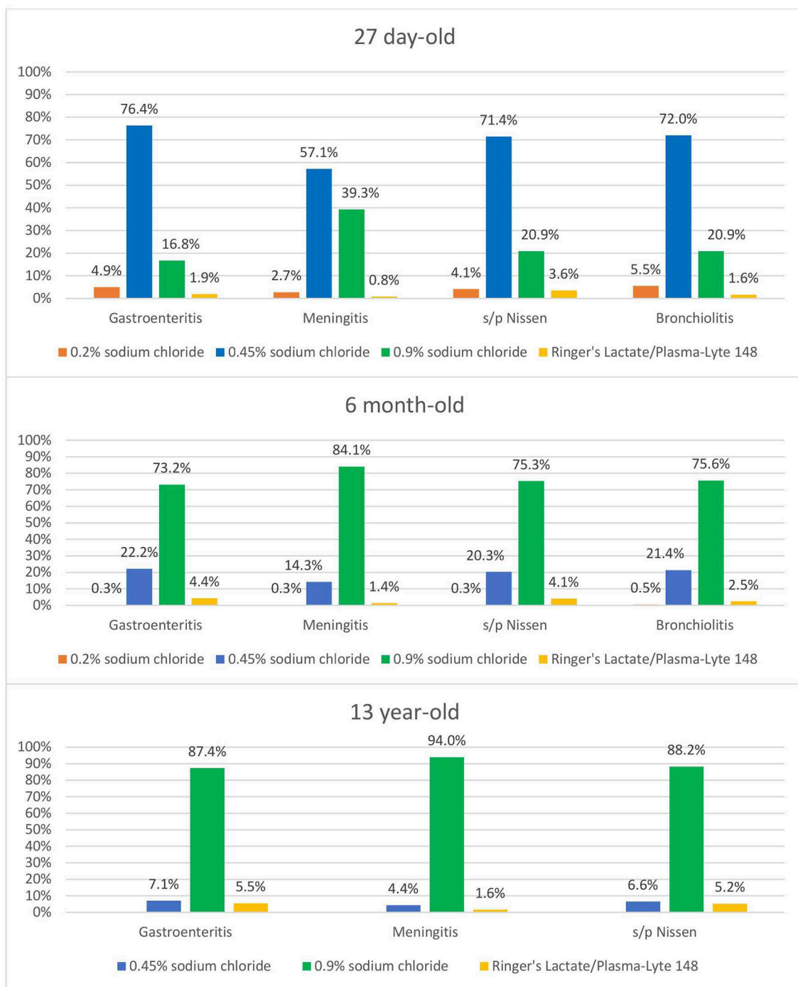
FIGURE 2 | Maintenance IV fluids selected by indication, for each age group.