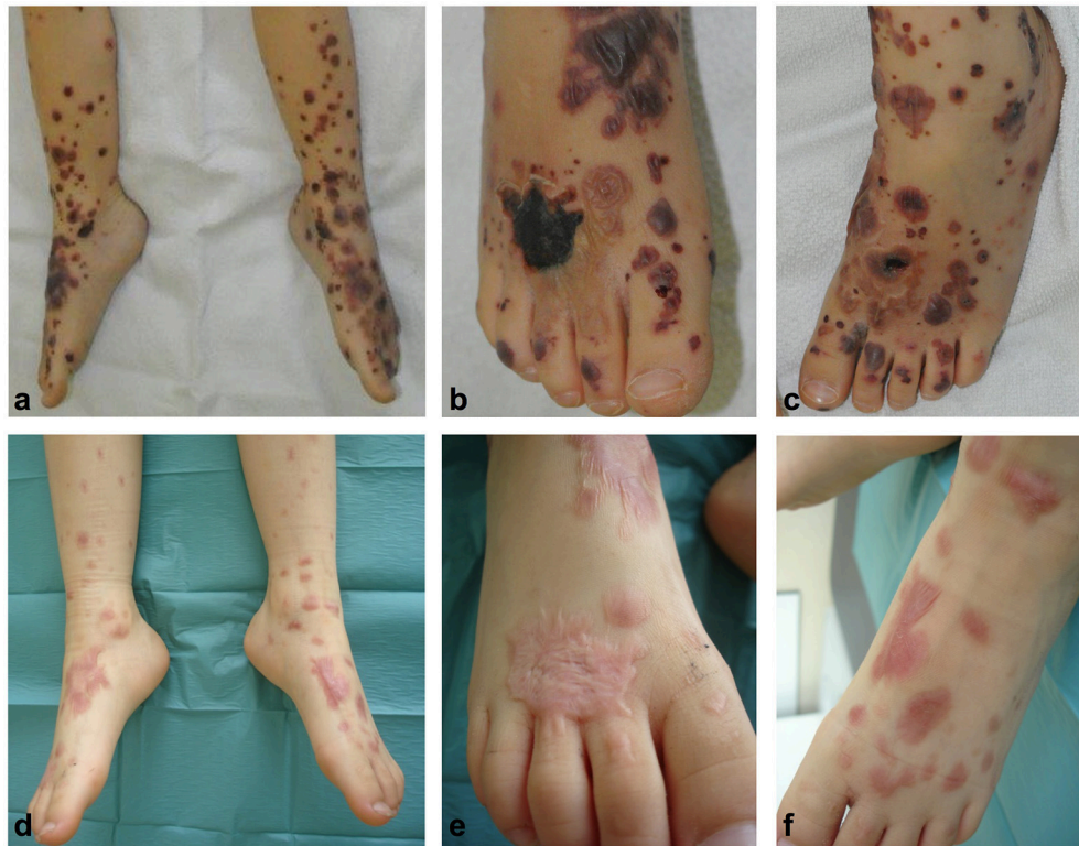
FIGURE 3 | Hemorrhagic bullae developed on both feet and lower legs (a-c). A deep necrosis resulting from a large blister at the dorsum of the right feet evolved (a,b) necessitating autologous skin transplantation. Re-examination 11 months after disease onset showed complete clinical remission of disease with re-epithelialization of affected areas (d-f).