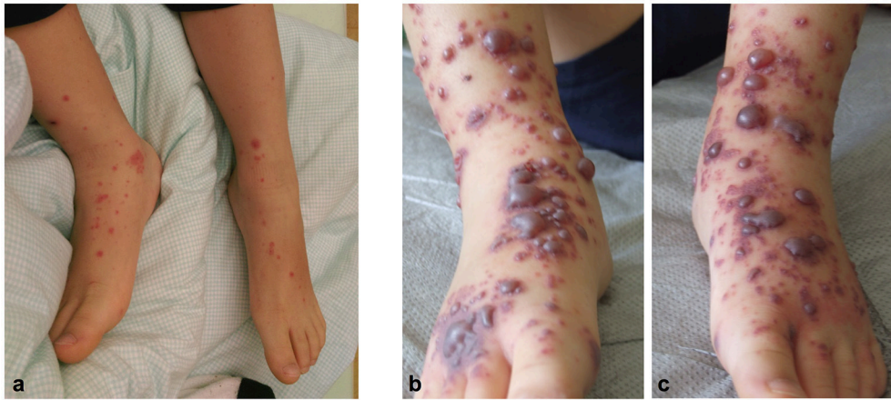
FIGURE 1 | An acute papulovesicular rash of both legs (a) rapidly evolved into palpable purpura and hemorrhagic-bullous lesions of variable size ranging from 5 to 40 mm (b,c) .