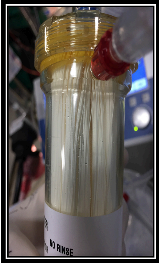
FIGURE 1 | Reusing large adult oxygenator. Private collection India 2016.