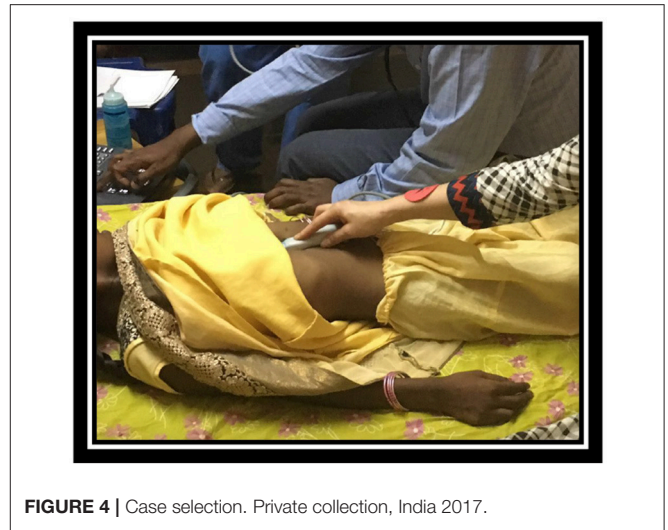
FIGURE 4 | Case selection. Private collection, India 2017.

stimulate them to use the skills on return to their home country. Beyond that, we have established friendship for life.