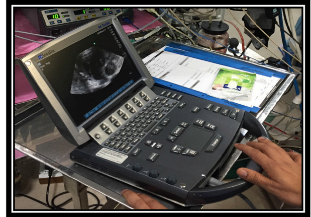
FIGURE 3 | Teaching session. Private collection India 2016.

(Figure 3), anesthetic agents and vasopressor support before and after cardiopulmonary bypass was provided. Weight and age related charts for ETT, laryngoscope, arterial and central line sizes as well as cardiopulmonary bypass cannulas, circuit and oxygenator sizes were introduced together with securing techniques for ETT and vascular lines.