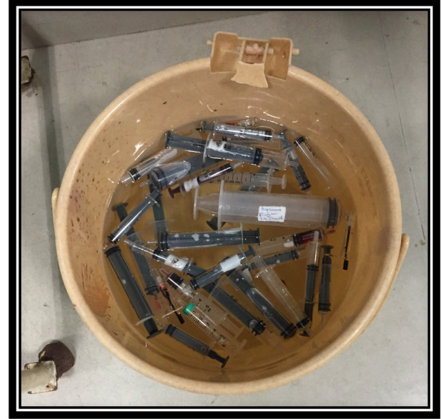
FIGURE 2 | Reusing syringes. Private collection India 2.