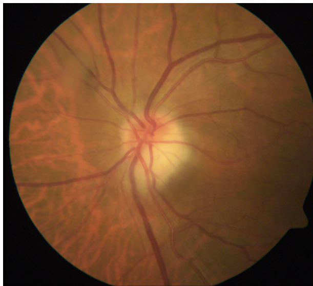
FIGURE 1 | Acute AAION.

Visual field testing may be helpful in demonstrating the severity of visual field loss in ischemic optic neuropathy if the visual acuity is sufficient (e.g. 20/200 or better); typical AAION generally causes severe loss of visual field but a wide variety of patterns may be seen (51, 53). Visual field testing is helpful in identifying scotomas that the patient may not have noticed, for example, in the better seeing eye which may still have early