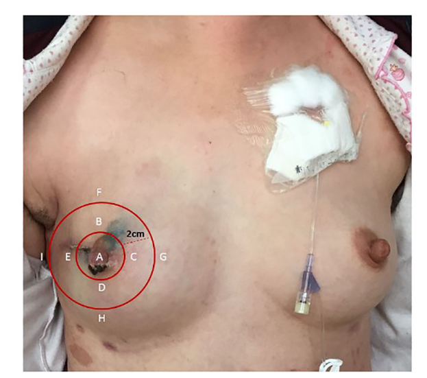
FIGURE 3 Nine points selected to assess the sensation. (A) The nipple. (B) 12 o'clock axis of the areola. (C) 3 o'clock axis of the areola. (D) 6 o'clock axis of the areola. (E) 9 o'clock axis of the areola. (F) 12 o'clock axis 2 cm from the areola. (G) 3 o'clock axis 2 cm from the areola. (H) 6 o'clock axis 2 cm from the areola. (I) 9 o'clock axis 2 cm from the areola.

SPSS 22.0 software. The randomized numbers were sealed in an envelope and stored until the study ended. The enrolled patients received immediate subpectoral prosthetic breast reconstruction after nipple-areola-sparing mastectomy with or without intercostal nerve anastomosis by the same breast surgeon according to the assignment. During the study, the researcher was responsible for the follow-up. The physicians who were involved in the patients' care and all patients were blinded. If any unexpected things happened to the enrolled patients, the physician could unmask the treatment assignment or remove the patient from the study.