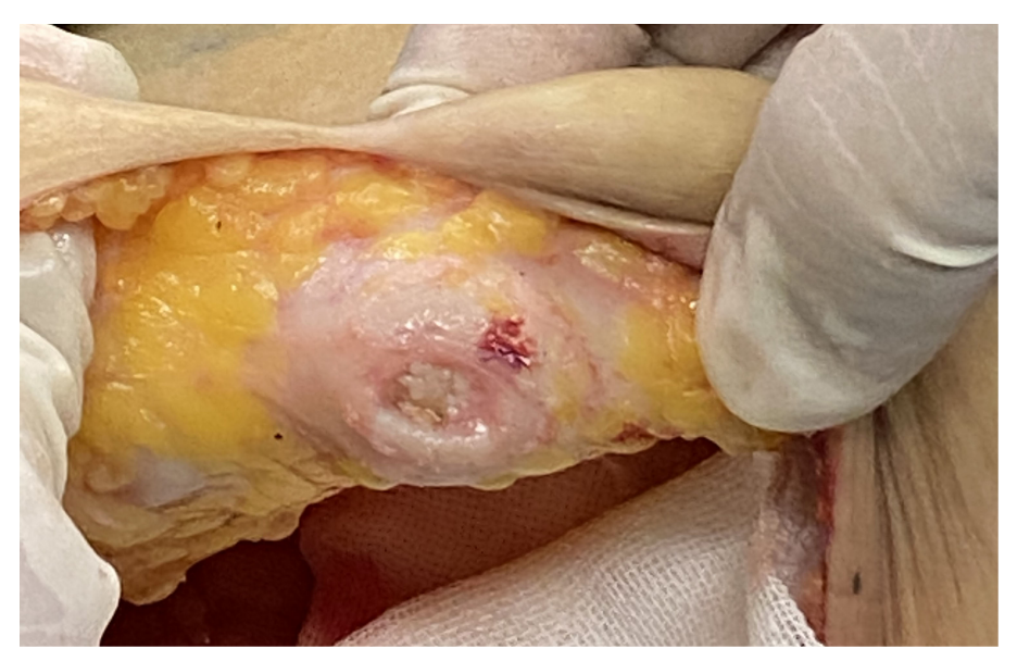
FIGURE 4 Skeletonized tissue behind the nipple.

In conclusion, we demonstrated that intercostal nerve anastomosis improved the local sensation of patients with immediate subpectoral prosthetic breast reconstruction after nipple–areola-sparing mastectomy, thus improving the patients' quality of life. This study can be considered as a "proof of concept" one, and hence the effectiveness of this therapy needs to be evaluated further in future trial(s) with a large sample size before it can be introduced for routine clinical use.