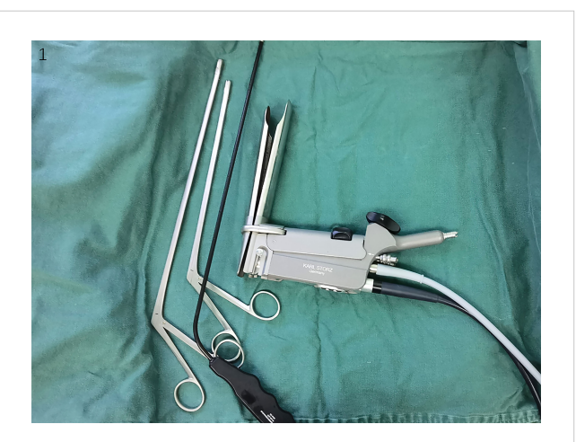
FIGURE 1 The instruments of expandable mediastinoscope

A 5-cm arc incision was made from the front edge of the left sternocleidomastoid muscle to the anterior midline of the neck, and the space between the muscle and the left side of the tracheoesophagus was separated into the first channel (i.e., the space on the left side of the neck and the esophagus). The left recurrent laryngeal nerve (RLN) was identified and protected, and the left paraesophageal cervical lymph nodes and left supraclavicular lymph nodes (left paraesophageal lymph node