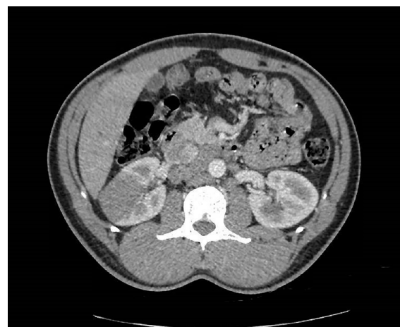
FIGURE 1 Axial enhanced CT scan showing the poorly delimited right renal mass at diagnosis.

The diagnosis of RMC was established based on a biopsy of the renal mass: analysis of eight biopsy samples revealed proliferation of a poorly differentiated carcinoma tumor consisting of basophilic cellular elements with increased nuclear–cytoplasmic ratio, irregular hyperchromatic nuclei, and frequent mitotic figures. The proliferation exhibited a trabecular-cord architecture, and there was