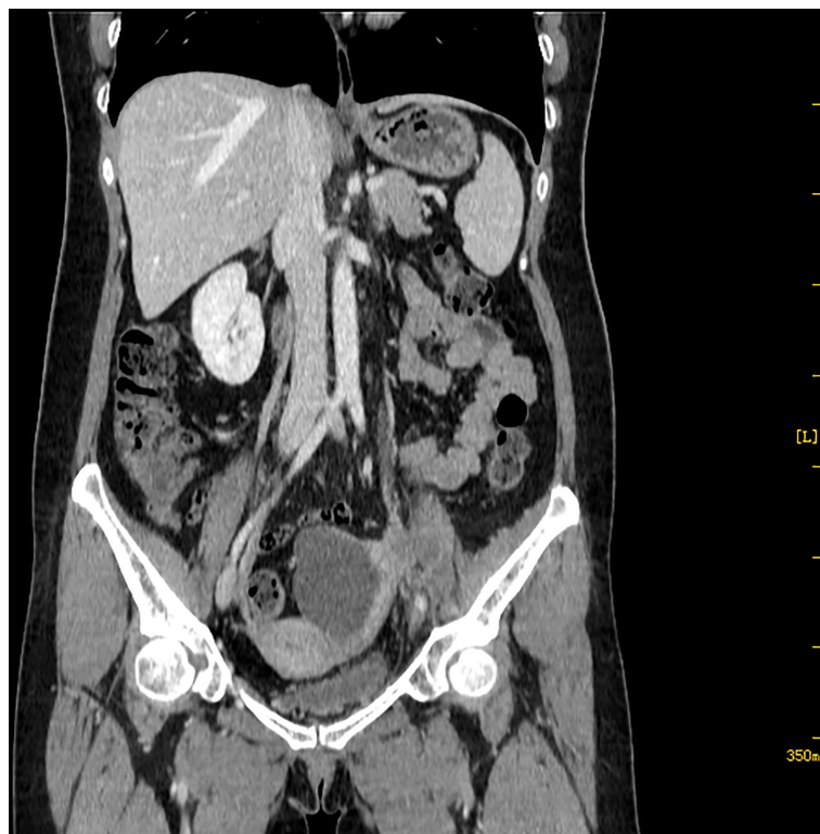
FIGURE 1 Abdominal CT shows a 7.1 \times 4.3 \times 5.4 cm septal cystic, solid mass was detected on the left adnexal, and the solid components were enhanced.

mass reported a poorly differentiated carcinoma of the ovary. A debulking surgery was performed, including total abdominal hysterectomy, bilateral salpingo-oophorectomy, pelvic and para-aortic lymph nodes dissection, omentectomy, appendectomy, and multiple peritoneal biopsies through a generous laparotomy, and there was no residual tumor. On grossly, the left adnexal mass section was grayish-white, solid, and crispy, and the fallopian tube and ovary were unremarkable. Her postoperative course was uneventful. Her postoperative pathology reported a poorly differentiated invasive SCC of the ovary without any other associated dermoid cysts, endometriosis, or Brenner tumors (Figure 2). The left fallopian tube, left pelvic peritoneal and lymph nodes, and the surface of the sigmoid colon showed tumor involved. The immunohistochemical assays of the ovarian mass revealed CK5/6+++、P63+++ (Figure 3)、P16++、P53+、CK10/13++、UroIII-、CK7-、CK20-、Ki67+(>95%). Postoperative careful examination of head and neck, Sinus films have done. Repeat chest x-rays, Pelvic examination, and Pap smear showed no evidence that her malignant tumor was of non-ovarian origin. She had no symptoms of the esophagus or pancreas, or bladder, thus the final diagnosis was pure primary oSCC and staged as International Federation of Gynecology and Obstetrics (FIGO) stage IIIA.