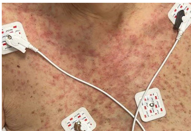
FIGURE 1 Morbilliform rash and blanching erythema on the back.

A punch biopsy of the back showed features consistent with mild interface dermatitis with basal layer vacuolization and scattered necrotic keratinocytes consistent with the erythema