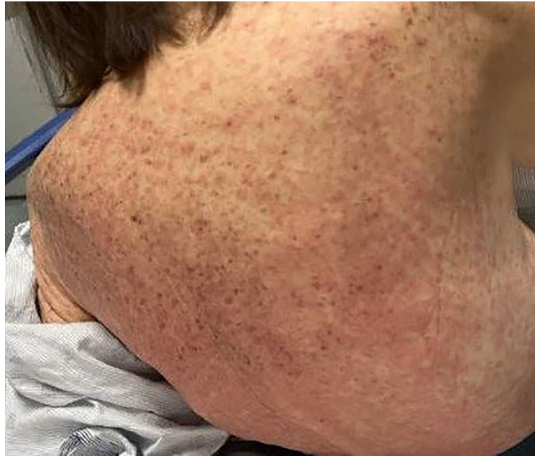
FIGURE 2 Morbilliform rash and blanching erythema on the trunk.

multiforme spectrum of disorders (Figure 4). Both alpelisib and fulvestrant were stopped. She was started on 1 mg/kg of methylprednisolone daily, and her symptoms improved markedly (Figures 5, 6). She was then transitioned to oral steroids with a regimen of 60 mg of prednisone daily for