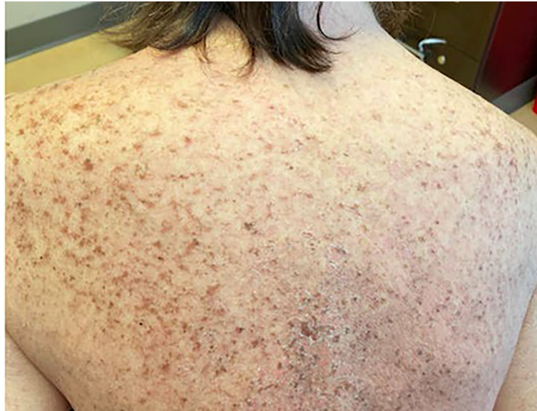
FIGURE 6 Patient's back 11 days after initial presentation.

SJS and TEN is based on the surface area, with SJS being diffuse and involving less than 10% of the total body surface area. It often manifests with widespread erythematous or purpuric macules or flat atypical target-shaped lesions. Conversely, TEN involves greater than 30% of body surface area and may present without any discrete lesions. Skin findings between 10% and 30% are classified as SJS/TEN overlap syndrome.