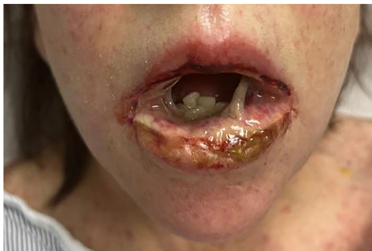
FIGURE 3 morbilliform rash Exudative and hemorrhagic sloughing of the lips and buccal mucosa.

7 days, then 40 mg of prednisone daily for 7 days, and then 20 mg of prednisone daily for 7 days. She had no long-term sequelae of SJS. Systemic treatment was held until her steroid taper was completed. Of note, she later tolerated subsequent fulvestrant therapy without any side effects.