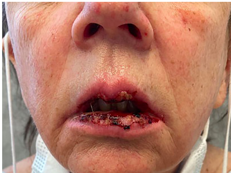
FIGURE 5 Patient's mouth 11 days after initial presentation.

million per year (2). Cases of SJS/TEN have often been associated with various types of antibiotics. These include sulfonamides, tetracyclines, and cephalosporins (3–5). Cases involving other medications including allopurinol, lamotrigine, and imidazole antifungals have also been seen (6–8). The distinction between