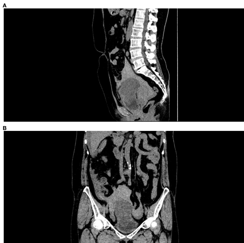
FIGURE 1 Enhanced CT scan shows pelvic hemorrhage. (A) Side view, (B) Front view.

During the preoperative examination process, the patient’s blood pressure and blood oxygen saturation decreased gradually, while the shock gradually increased. Following an assessment of