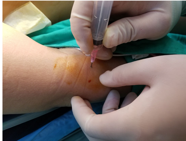
FIGURE 4 Forearm brachioradialis muscle by homogenate injection.