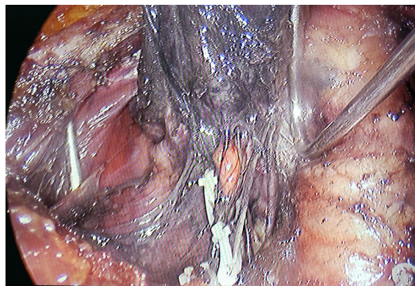
FIGURE 1 "Negative imaging" of parathyroid glands.

Statistical analyses were performed using SPSS software version 22.0 (IBM Corp., Armonk, NY, USA). Categorical data are expressed as numbers with percentage and were compared using the chi-square or Fisher's exact test. Continuous data with a normal or near-normal distribution are expressed as means