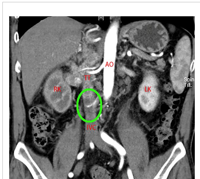
FIGURE 2 | A 53-year-old man was admitted to the hospital with “painless gross hematuria for 3 months”. CTU examination revealed a tumor of the right kidney (maximum diameter 3 cm). The right RV, IVC (below the second hepatic portal) and part of the left RV were widened with uneven enhancement, TT considered. The boundary between TT and the venous wall was unclear, and vascular wall invasion was considered. Bland thrombus formed at the distal end of the IVC (green circle). T.H.R.O.B.V.S. score: 0 + 2+0+1+2+2+0 = 7 points, belonging to the high-risk group. AO, aorta; RK, right kidney; LK, left kidney; IVC, inferior vena cava; TT, tumor thrombus.

The postoperative complications in each group are shown in Table 4 . Seven cases (21.88%) had postoperative complications in the low-risk group, including 5 cases (15.63%) with notable complications. They were apparent lymphatic leakage, lower extremity thrombosis, pulmonary infection, anemia, and incomplete intestinal obstruction. Most cases relieved after anti-infection, blood transfusion, and gastrointestinal decompression. There was also a case of acute renal failure after the operation, which was cured by hemodialysis. Twenty-three complications (25.84%) were reported in the middle-risk group, twenty cases (22.47%) of which were notable complications, with a higher prevalence of lymphatic leakage,