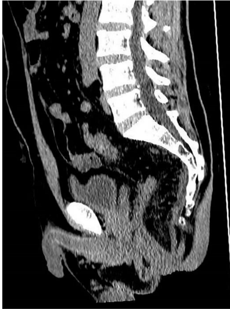
FIGURE 2 | CT image after removing the trans-anastomotic drainage tube (postoperatively day 7).

undergone ileostomy closure, one year after ISR. A total of 30 patients (88.2%) met the above criteria and were analyzed; four patients were not included in the comparison since they underwent ISR less than one year prior. Postoperative anal function is shown in Table 3 , the baseline characteristics between subgroups were comparable (the detailed baseline characteristics were shown in Supplementary Table S1 ). Although the TADT group outperformed the non-TADT group in anal function evaluation on stool frequency ( p=0.949 ), urgency (16.7% vs. 22.2%; p=1.000 ), and Wexner incontinence score ( 6.8 \pm 2.7 vs. 7.4 \pm 2.7 ; p=0.581 ), the differences were not statistically significant. The proportions of Grade 2 and Grade 3 cases as per the Kirwan classification were relatively high in both groups, and the difference was not statistically significant ( p>0.05 ). No patient required colostomy due to severe fecal incontinence (Grade 5). Since AL may affect anal function and confound the effects of anastomotic tube placement on anal function, we analyzed the influence of