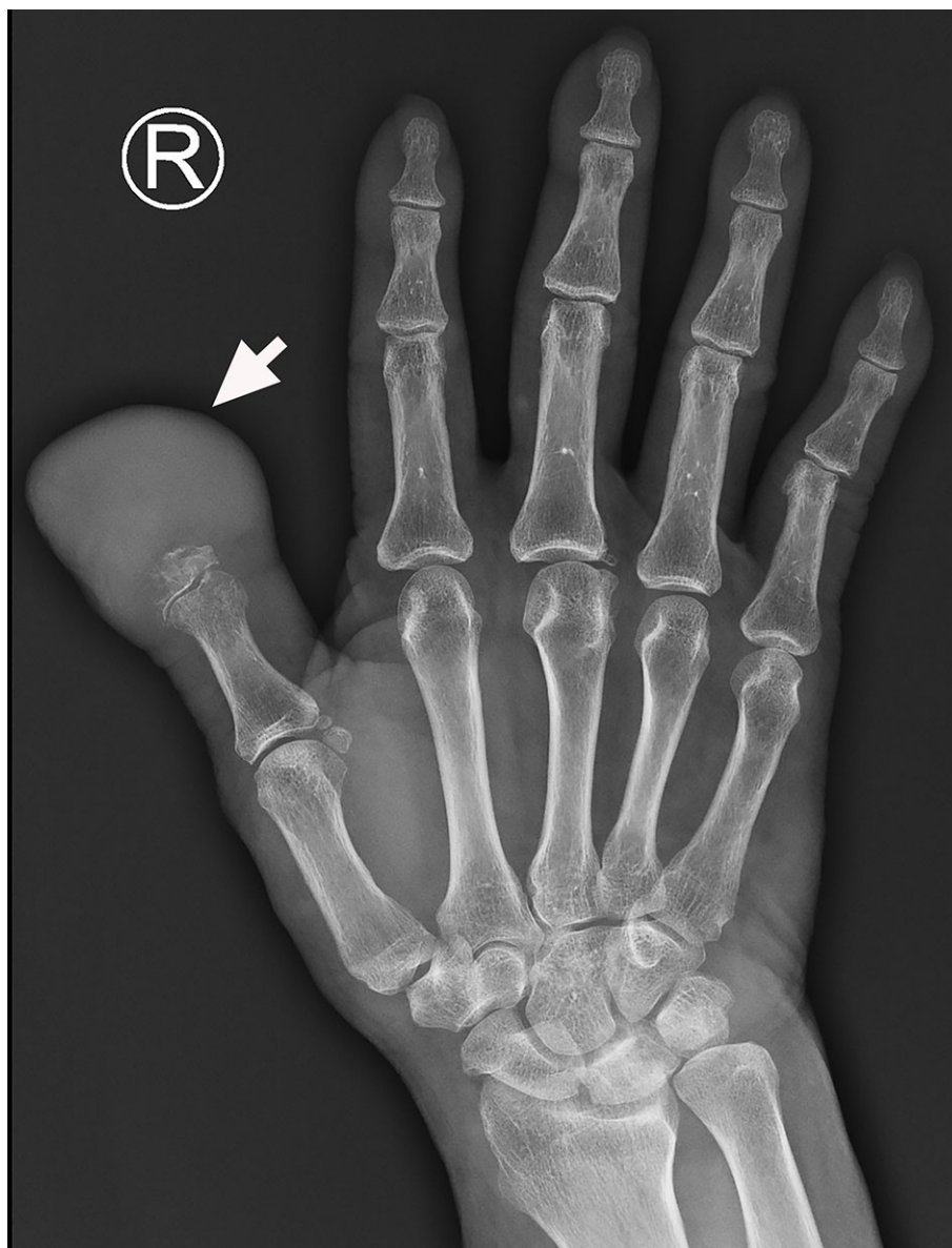
FIGURE 1 The X-ray image shows a mass at the distal end of the right thumb with marked phalanx destruction (arrow).

Taken together, the above findings support the diagnosis of MPTT. A needle biopsy performed on the right axillary lymph node confirmed the presence of metastatic MPTT. Adjuvant chemotherapy was planned after surgery, and the patient was discharged. After surgical resection, he was followed for 6 months, and there was no report of recurrence.