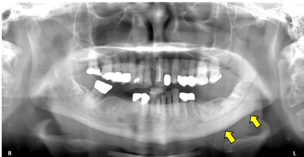
FIGURE 2 | Panoramic radiograph showing sclerosis of the left mandible (yellow arrows) surrounding the inferior alveolar canal. No evidence of sclerosis in the right mandible.