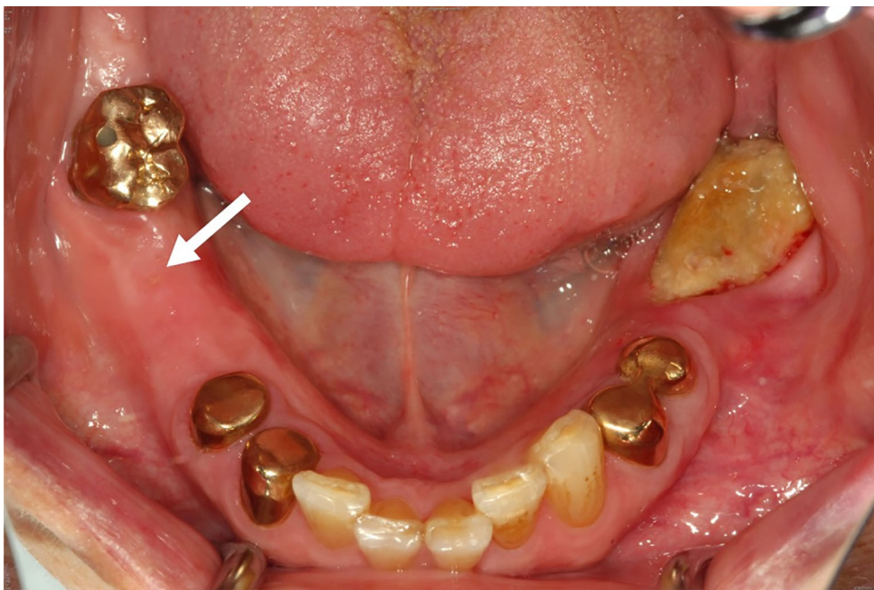
FIGURE 1 | Clinical presentation of the MRONJ showing bone exposure in regions 36 to 38 and a fistula and palpable bone in region 46 (white arrow).

The patient was admitted to the hospital and received 3 g of ampicillin/sulbactam three times a day combined with metronidazole 500 mg three times a day. After 3 days, pain was relieved and the patient further denied surgery. After 4 days, antibiotics were applied orally (sultamicillin) and the patient was discharged. Antibiotics were continued for 45 days in total. A