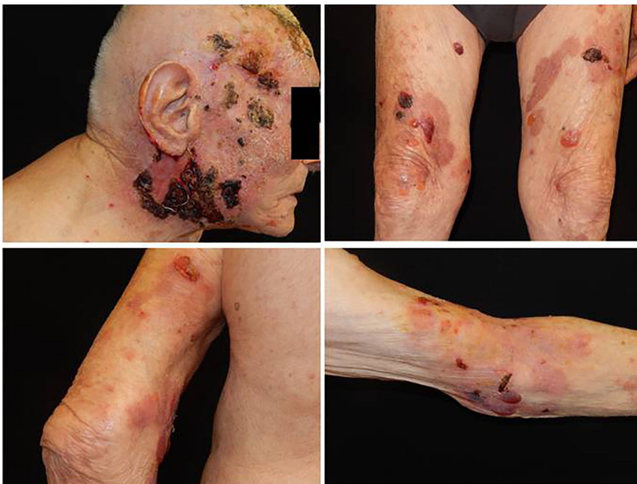
FIGURE 2 | A large necrotic haemorrhagic eschar on the head (face and scalp), with ulcers and serohematic scars associated with blisters over skin, with serum content, localized on the trunk and extremities.

Approximately 5 months after the first observation, the patient showed significant recovery, and there was no recurrence of