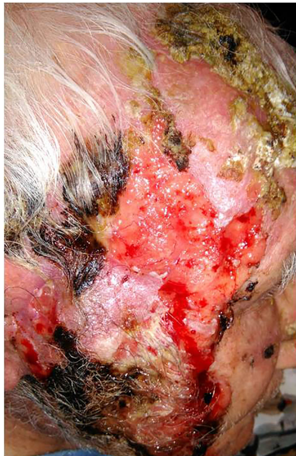
FIGURE 1 | Locally advanced locally cutaneous squamous cell carcinoma of the face extending to the zygomatic area close to the lower eyelid, the right cheek and the mandibular area, characterized by necrotic ulcerated areas and infiltration of subcutaneous tissue.

infiltration of subcutaneous tissue, with a high proliferative rate (Ki-67, 90%) associated with wide necrotic and ulcerated areas, thus confirming the clinical impression of CSCC. Clinically, other smaller but similar lesions were localised in the patient's left zygomatic area, the left ear, and upper limbs. Computed tomography (CT) scan was negative for regional or distant metastases. The patient was initiated on immunotherapy with cemiplimab (350 mg flat dose every 3 weeks) in February 2020. Soon after the first cycle, the lesions became non-ulcerated and progressively thickened with crust evolution. The treatment