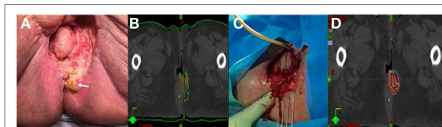
FIGURE 1 | (A) Pretreatment image of Patient A's posterior lesion adjacent to the anus (white arrow). (B) Preplanning computed tomography (CT) scan for patient A with mock-up of needle placement. (C) Treatment setup for patient A showing placement of guide needles (prior to flexible breast catheter placement). (D) Brachytherapy treatment plan for patient A (red = gross tumor, brown = rectum).

structures and prevent the need for extensive surgery, the patient was treated with HDR interstitial brachytherapy with Ir-192.