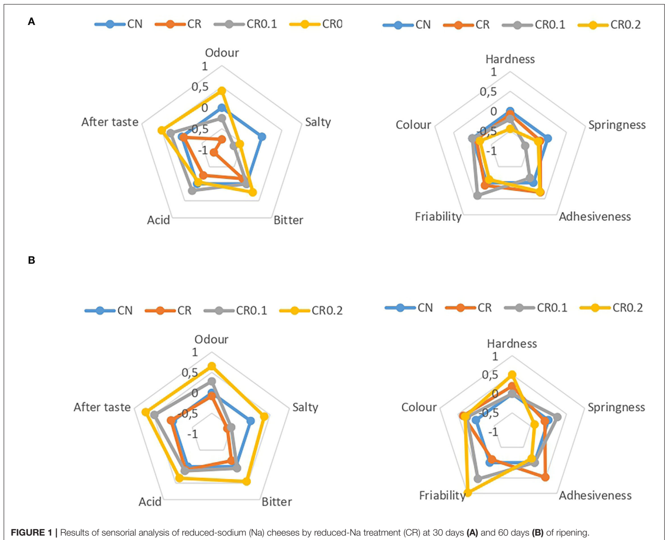
Figure 1 shows the sensory results of CR at 30 and 60 days of ripening. We must take into consideration that CR were compared to CCs, with minimal, moderate, and high differences being valued in the scale of 1–3, respectively. The reduction of salt had no significant difference in the color or texture perception of cheeses. The aroma was higher in cheese containing 0.2% of flavor enhancer, with minimal differences with respect to CC. The reduction of salt caused less sensation of saltiness in cheeses, becoming CR the least valued, followed by C0.1 and