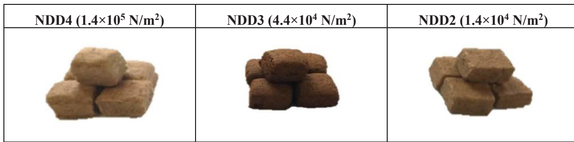
FIGURE 1 | Different textures of cookie.

soda. The processes were preheated in the oven at 180°C, bake at 180°C for 5 min, then bake at 140°C for 5~10 min. For pureed cookie (NDD2) made with yolk, potato starch, black soybean koji powder, erythritol, and vegetable oil. The processes were preheated oven to 170°C and bake for 8–12 min. The figures of cookies as shown in Figure 1 .