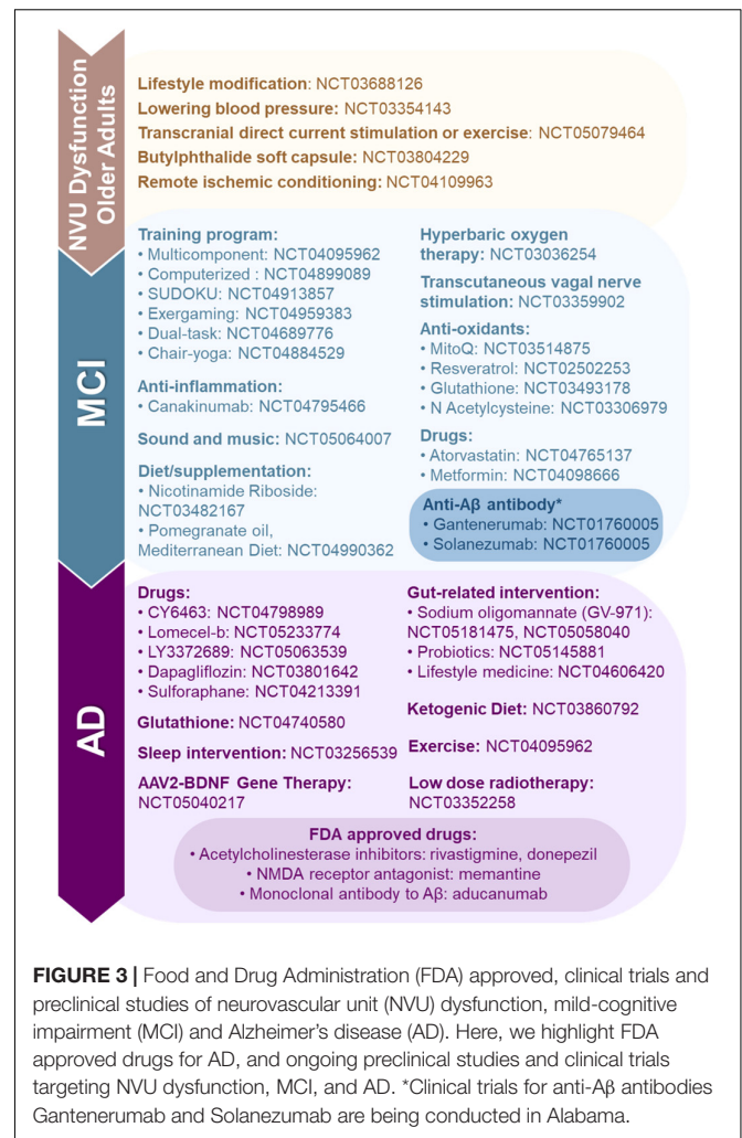
FIGURE 3 | Food and Drug Administration (FDA) approved, clinical trials and preclinical studies of neurovascular unit (NVU) dysfunction, mild-cognitive impairment (MCI) and Alzheimer's disease (AD). Here, we highlight FDA approved drugs for AD, and ongoing preclinical studies and clinical trials targeting NVU dysfunction, MCI, and AD. *Clinical trials for anti-Aβ antibodies Gantenerumab and Solanezumab are being conducted in Alabama.

Although age is a major factor in the development of vascular dysfunction, dementia, and AD, it does not affect the older populations equally, especially those individuals of disadvantaged backgrounds, due to socioeconomic and