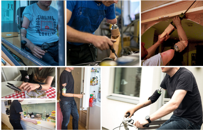
FIGURE 2 | Neuromusculoskeletal prostheses used in daily life. Participants used an arm prosthesis directly interfaced to their skeleton, nerves, and muscles (neuromusculoskeletal) in professional and personal activities of the daily living for over 7 years. The prostheses do not require additional computational or powering equipment that is not already contained within the prosthetic arm itself (self-contained).