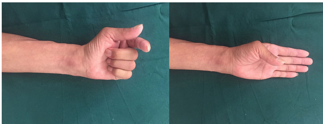
FIGURE 3 Postoperative functional assessment at 6 months.

the transplant is evaluated on an hourly schedule. During transplant surgery and afterwards, a pulse oximeter is used to monitor the unaffected and transplanted limbs' blood flow. Using a device for measuring skin temperature, the surface of the transplanted hand's fingers is compared with those on the unaffected limb (58). Temperature measurements should be recorded at a minimum of 30°C or above. It is imperative to promptly notify the attending physician immediately of a decrease in body temperature or alteration in the circulatory condition. Keeping the recipient's room at 24°C is recommended. The consumption of caffeine is contraindicated for the patient, and smoking is strictly restricted. The family is advised to