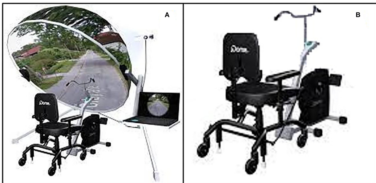
FIGURE 2 (A) Exercise bike associated with the JDome virtual reality system. (B) Standard exercise bike obtained from the JDome System.