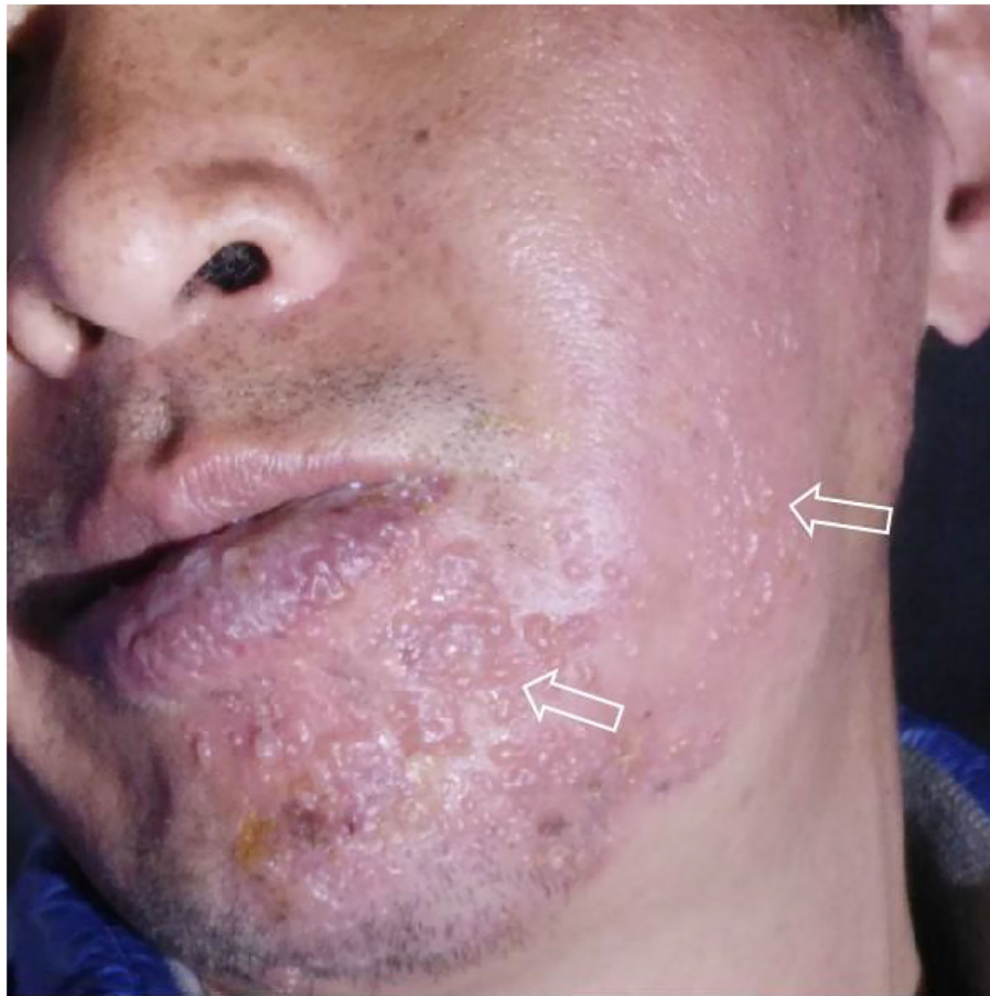
FIGURE 1 Typical unilateral aggregated vesicular rash at the beginning of the disease (2021.4.13), which originated from the patient's self-photography (mirror image).