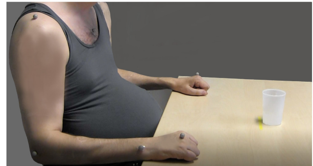
FIGURE 2 | The initial sitting position and marker placements on the body for the kinematic drinking task shown in a participant with spinal cord injury (SCI) (the markers on the head, left shoulder, and the drinking glass are not visible).

A standardized drinking task protocol with good test-retest reliability was applied in this study (23–25). In short, the participants were instructed to sit in front of a table with their back against the chair back ( Figure 2 ). The chair and table height were adjusted to attain 90° knee and hip flexion, 90° elbow flexion, while the upper arm was in the vertical and forearm in the horizontal positions. The wrist joint was aligned with the table edge, and the palm of the hand was resting on the table. This standardization of the initial sitting position resulted in that for each participant the drinking cup was approximately at 75% of the arm's length. Participants using the wheelchair remained sitting in their own chair but the testing was standardized as described above, as far as possible, by adjusting the table height.