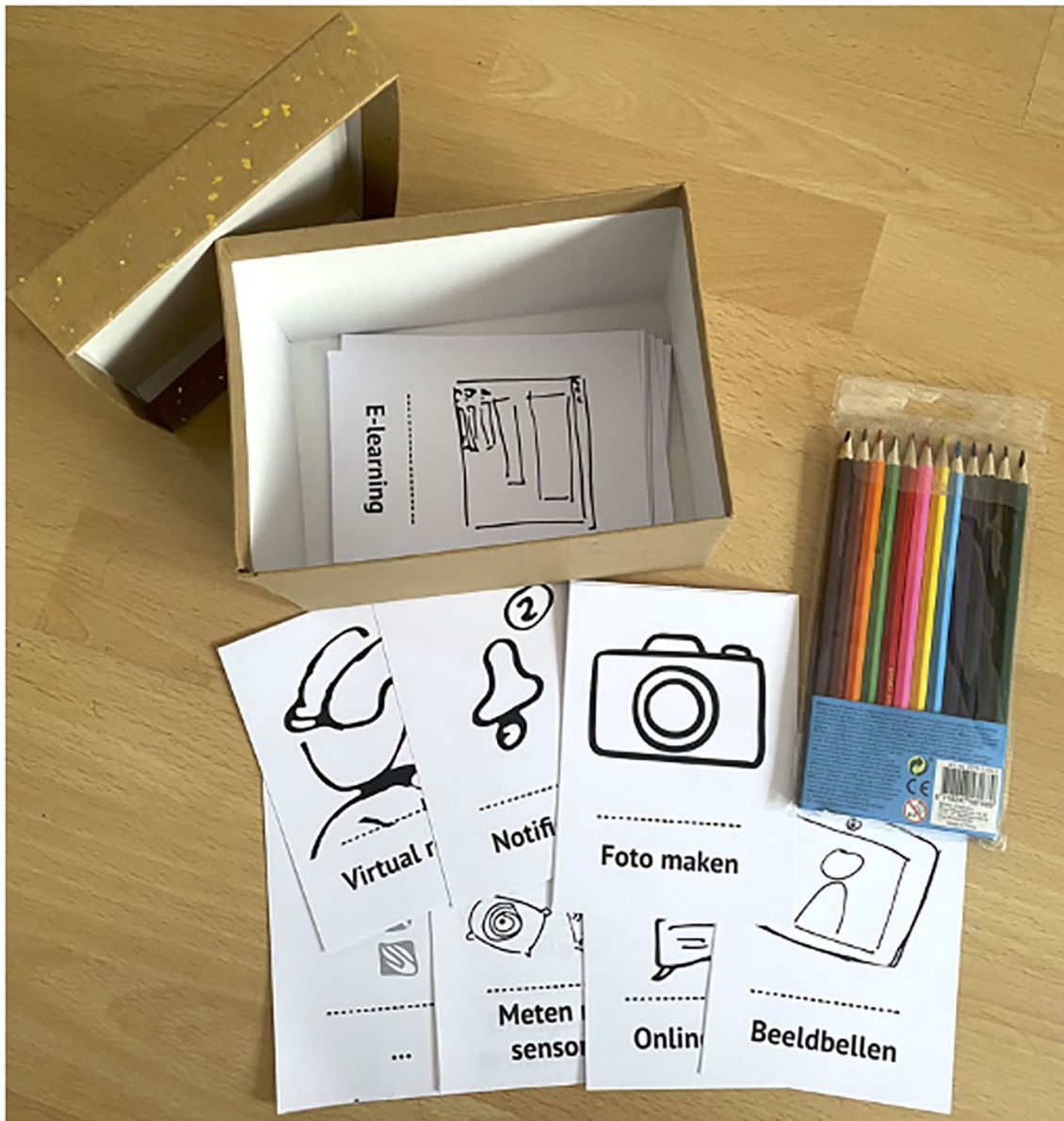
FIGURE 2 | Example of a tailor-made toolkit.

prototypes of the eHealth platform (e.g., a definitive decision on functionalities and scenarios how the platform is envisioned to be used).