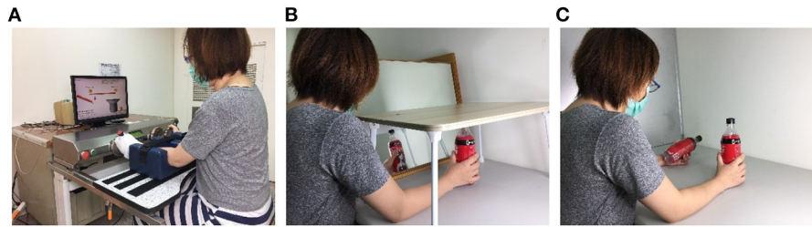
FIGURE 1 | Intervention setup for Bi-Manu-Track robot (A), mirror therapy (B), and bilateral upper limb training (C).