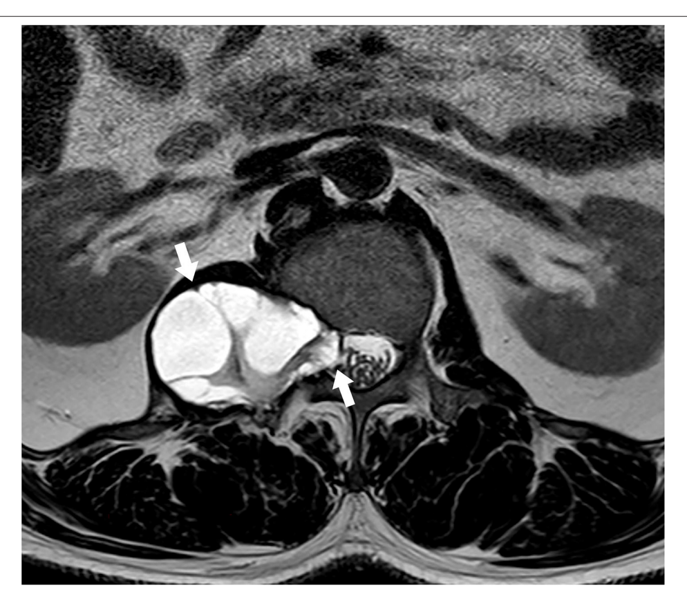
FIGURE 1 | MRI T2WI (axis image) showing hyperintense signal of an oval solid-cystic cavity at the right side of the vertebral body and across through the enlarged L1~L2 intervertebral foramen. Left arrow: The part outside of the spinal canal. Right arrow: The part passing through the intervertebral foramen and inside of the spinal canal.

the compression of the spinal cord or nerve root may occur, due to various shapes of the space formed by the spinal canal and its surrounding soft tissues, the different shapes of the hydatid cyst can be formed.