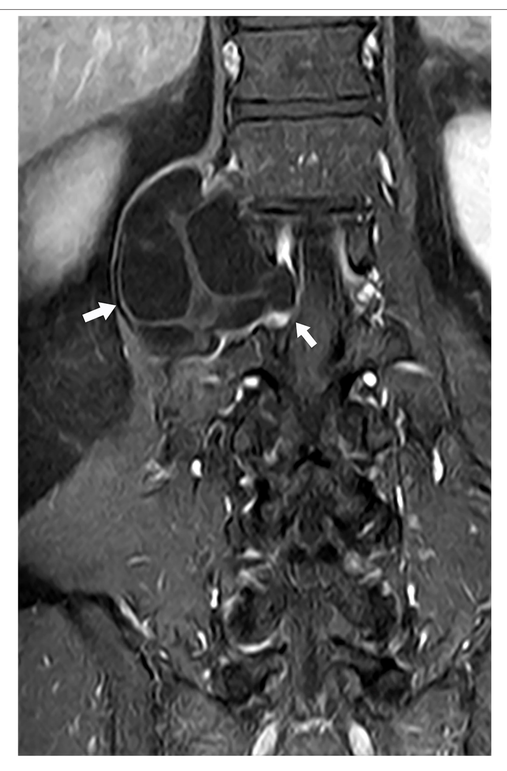
FIGURE 2 | MRI T1WI (coronal image) showing corresponding intervertebral foramina around the cavity was enlarged. Left arrow: The part outside of the spinal canal. Right arrow: The part passing through the intervertebral foramen and inside of the spinal canal.

signal intensity on MR imaging. Differential diagnosis is also needed to avoid misdiagnosis with the aneurysmal bone cyst, giant cell tumor of bone, isolated bone cysts, arachnoid cysts, fibrocystic diseases, chondrosarcomas, and tuberculosis, etc. (11).