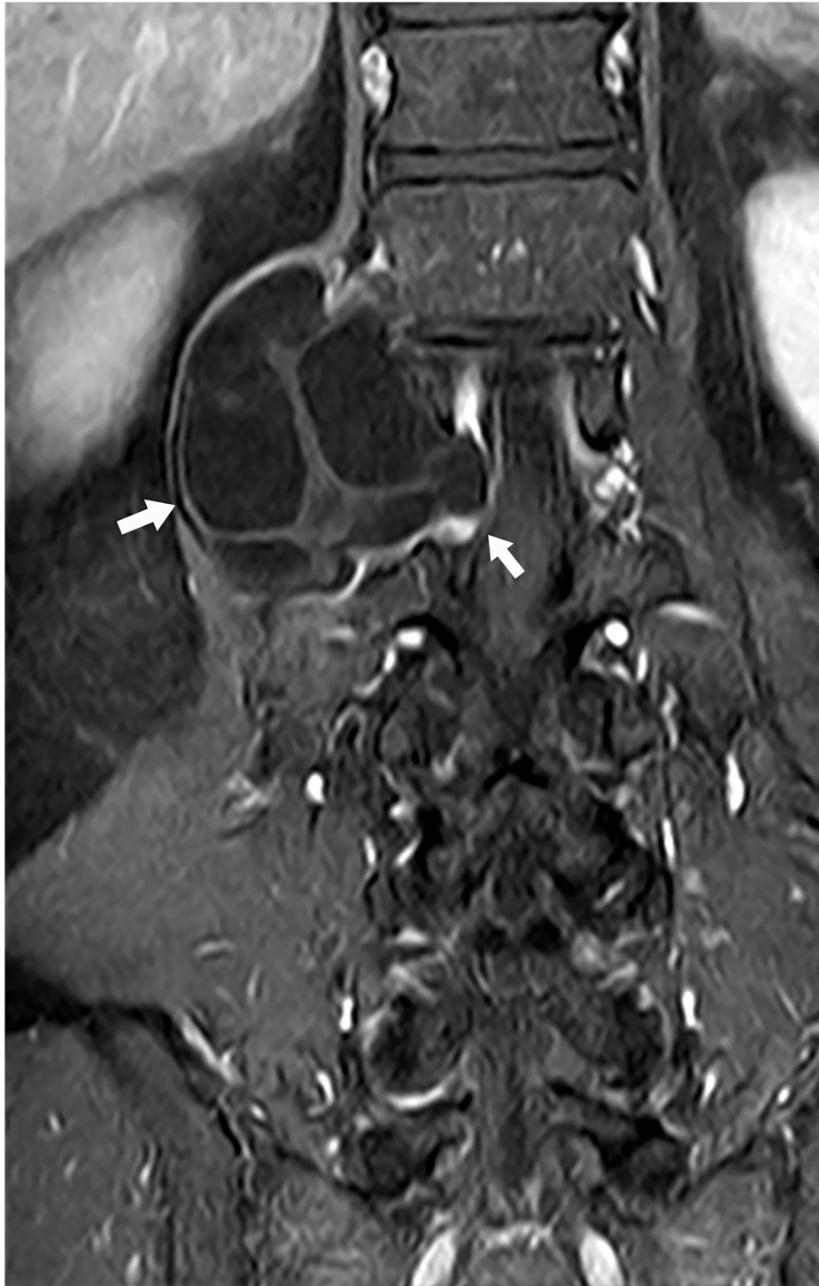
FIGURE 2 | MRI T1WI (coronal image) showing corresponding intervertebral foramina around the cavity was enlarged. Left arrow: The part outside of the spinal canal. Right arrow: The part passing through the intervertebral foramen and inside of the spinal canal.

signal intensity on MR imaging. Differential diagnosis is also needed to avoid misdiagnosis with the aneurysmal bone cyst, giant cell tumor of bone, isolated bone cysts, arachnoid cysts, fibrocystic diseases, chondrosarcomas, and tuberculosis, etc. (11).