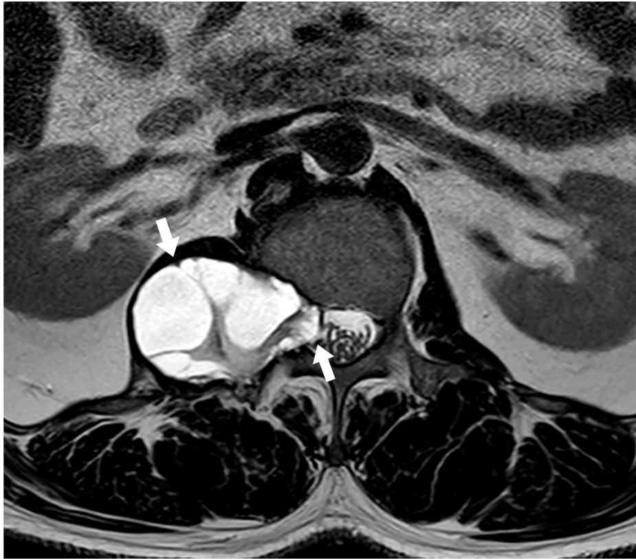
FIGURE 1 | MRI T2WI (axial image) showing hyperintense signal of an oval solid-cystic cavity at the right side of the vertebral body and across through the enlarged L1~L2 intervertebral foramen. Left arrow: The part outside of the spinal canal. Right arrow: The part passing through the intervertebral foramen and inside of the spinal canal.

the compression of the spinal cord or nerve root may occur, due to various shapes of the space formed by the spinal canal and its surrounding soft tissues, the different shapes of the hydatid cyst can be formed.