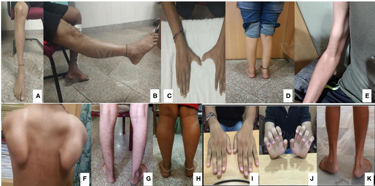
FIGURE 3 | Classical features of common subtypes identified. GNE myopathy (A–C): Tibialis anterior (TA) muscle wasting, normal quadriceps, and first dorsal interossei (FDI) muscle wasting identified, respectively. Dysferlinopathy (D,E): Gastrocnemius wasting and biceps lump. Calpainopathy (F,G): Scapular winging and ankle contracture. Sarcoglycanopathy (H): Calf hypertrophy. Collagenopathy (I–K): Long finger flexor and ankle contractures.