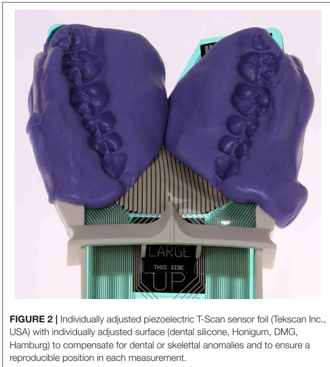
FIGURE 2 | Individually adjusted piezoelectric T-Scan sensor foil (Tekscan Inc., USA) with individually adjusted surface (dental silicone, Honigum, DMG, Hamburg) to compensate for dental or skeletal anomalies and to ensure a reproducible position in each measurement.

arch using dental silicone (Honigum, DMG, Hamburg). Doing so helps to compensate for some of SMA typical dental or skeletal anomalies by flattening the contact surface ( Figure 2 ). Compatibility of the intraoral T-Scan sensor with the I-Scan software guarantees an accurate calibration, equilibration, and quantification of bite force (31). The combination of T-Scan sensor foil and I-Scan software has been successfully applied in preliminary studies (32, 33). Though less cost-efficient than unilateral bite force measurement via the Flexiforce sensor (29), this safe, straightforward clinical application may be an attractive alternative in the case of larger patient groups.