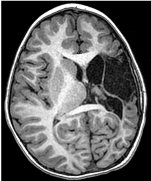
FIGURE 1 | Patient #x. Axial T1-weighted MRI obtained at age 5 years, demonstrating a left middle cerebral artery distribution infarct and a disproportionately small left cerebral hemisphere.

At the age of 5 years and 10 months he underwent an uneventful lateral hemispherotomy. He remained free of clinical seizures after surgery. Within 3 months of surgery he was once again toilet-trained but continued to have difficulties with attention, hyperactivity and obsessive behaviors. Post-operative EEG showed complete resolution of ESES ( Figure 3 ). At last clinical follow-up, 2.5 years after surgery (age 8 years) he was off seizure medication, taking only guanfacine for ADHD, and making excellent progress in school. He completed a post-surgical neuropsychological evaluation at age 8 years, 3 months; 28 months after surgery. Whereas, pre-surgically he demonstrated minimal developmental progress, in the post-surgical evaluation he demonstrated significant gains in verbal abilities which improved to the average range. His non-verbal or visual spatial abilities remained mildly deficient, consistent with what is often seen as a result of early dominant/left hemisphere injury and subsequent functional reorganization. Memory remained intact, but attention problems persisted and remained consistent with ADHD.