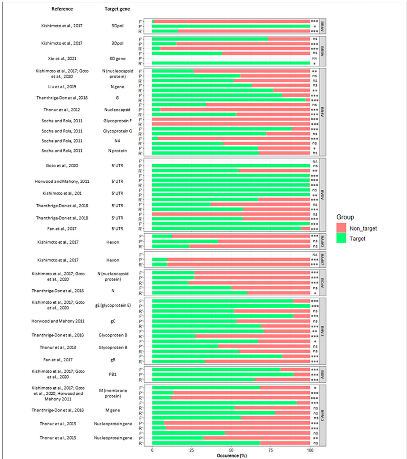
FIGURE 2 | Occurrence of target and non-target sequence alignment for published primer and probe sequences targeting the respiratory disease-causing viral pathogens in cattle. Bovine coronavirus (BCoV), Bovine herpesvirus 1 (BHV-1), Bovine rhinitis A virus (BRAV), Bovine rhinitis B virus (BRBV), Bovine respiratory syncytial virus (BRSV) Bovine influenza D virus (BIDV) Bovine viral diarrhea virus (BVDV), Bovine parainfluenza virus 3 (BPIV-3), and Fisher's exact test; p > 0.05 ns, p \leq 0.05 *, p \leq 0.01 **, p \leq 0.001 ***.